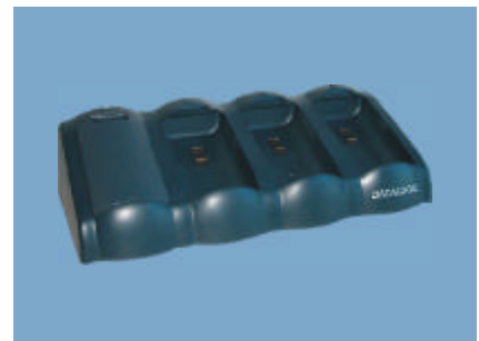
Multiple Battery Charger